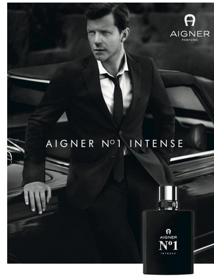
THE NEW FRAGRANCE FOR MEN AIGNERPARFUMS.COM

Height 185cm/6'1" Chest 102cm/40" Waist 81cm/32" Suit 102cm/40"/50 Suit Length R Shoe 44 EU/10 US/9.5 UK Hair Brown Eyes Green